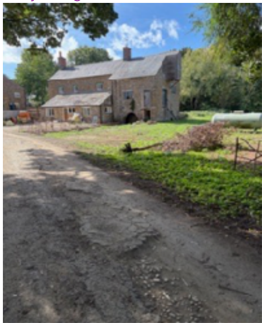
Paper Mill Cottages